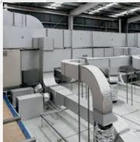
HVAC and firefighting system