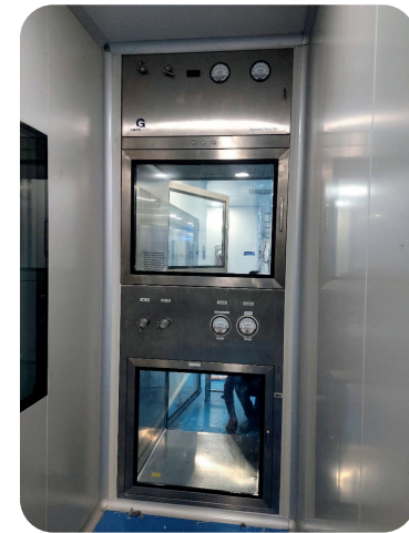
DYNAMIC PASS BOX