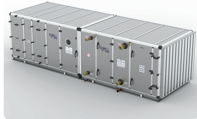
AIR HANDLING UNIT (AHU)