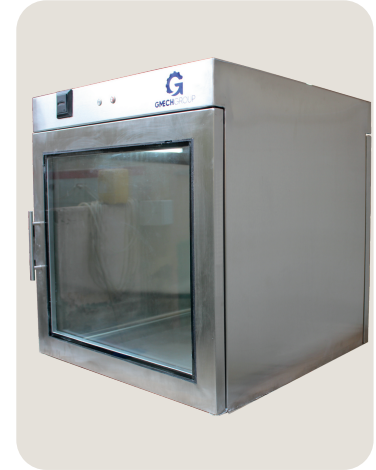
STATIC PASS BOX