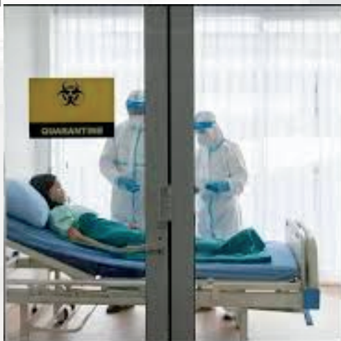
Isolation Room Preparation