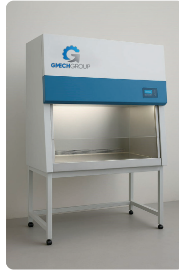
BIO SAFETY CABINET