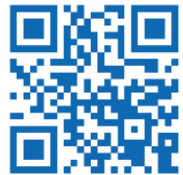
FOR MORE INFORMATION VISIT OUR WEBSITE