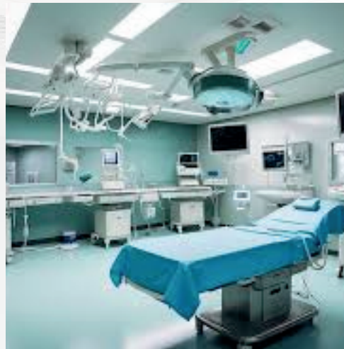
Operating Room preparation