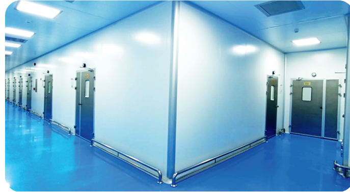
AIR HANDLING UNIT (AHU)