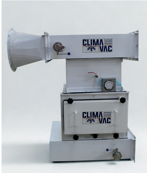
BAG IN BAG OUT(BIBO)